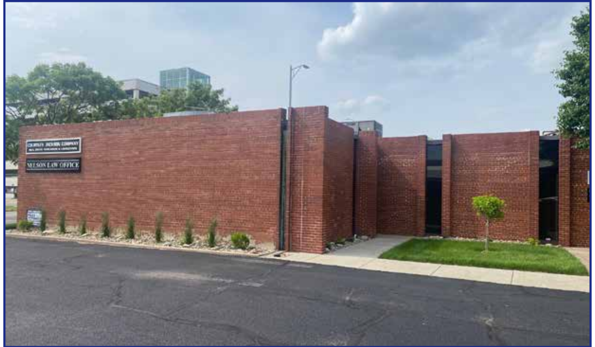
South side of building / private entrances

For more information or to schedule a showing please contact Tony or Tim.