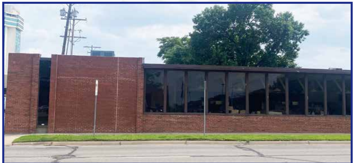
North side of building

For more information or to schedule a showing please contact Tony or Tim.