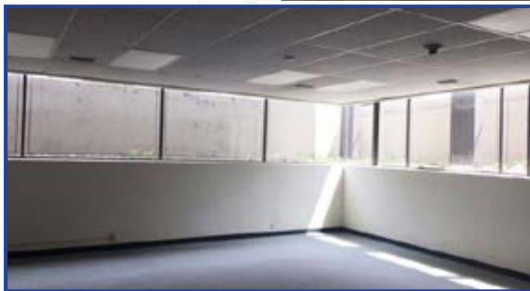
Terrace Level Daylights