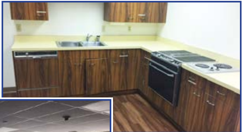
Terrace Level Kitchen