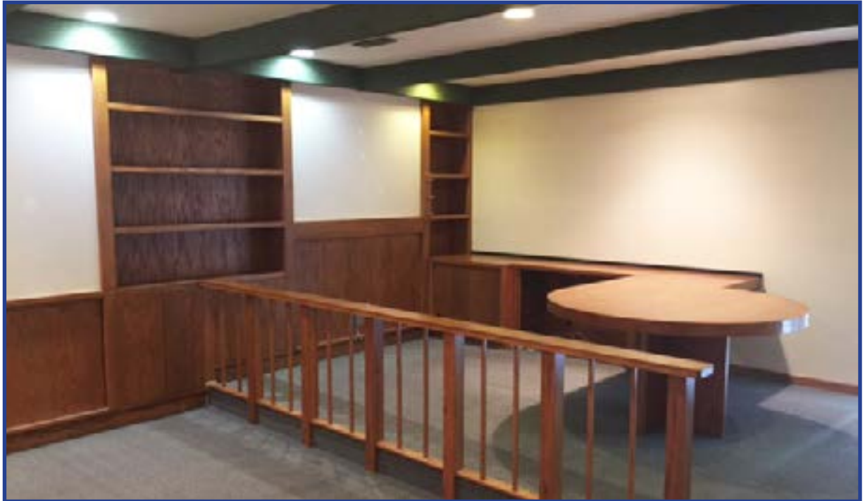
2nd Floor Built-ins

For more information or to schedule a showing please contact Tony or Calvin.