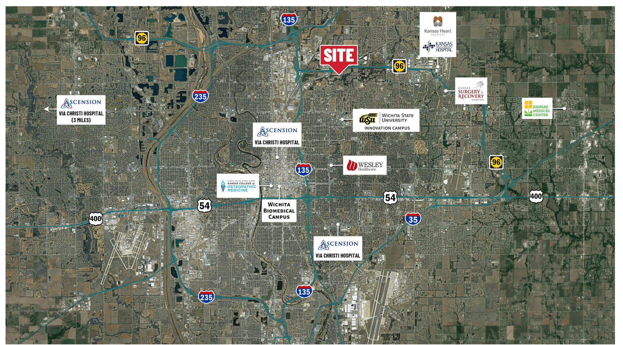
HIGHWAY K-96 & HILLSIDE WICHITA, KS 67219